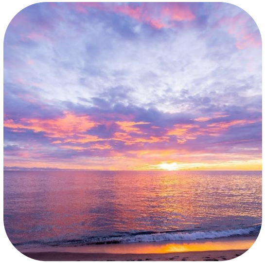
The Setting Sun Aruna Alli