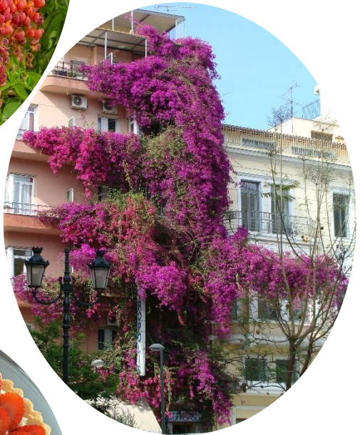
A Trailing Plant Marsha Lipsius