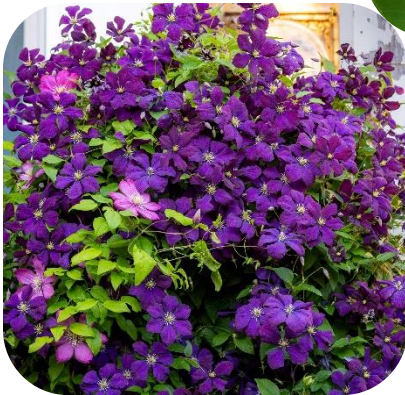
A Trailing Plant Aruna Alli